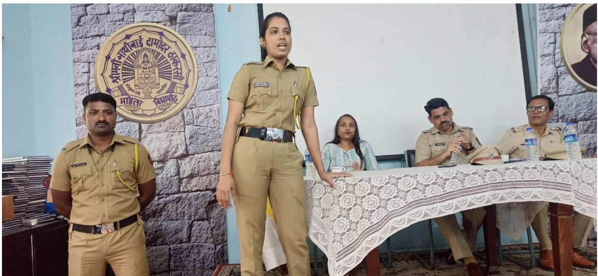
"Cyber Security and Women" Under "Azadi ka Amrit Mahotsav" With Collaboration of Churchgate Railway Police on 12 th August 2022.