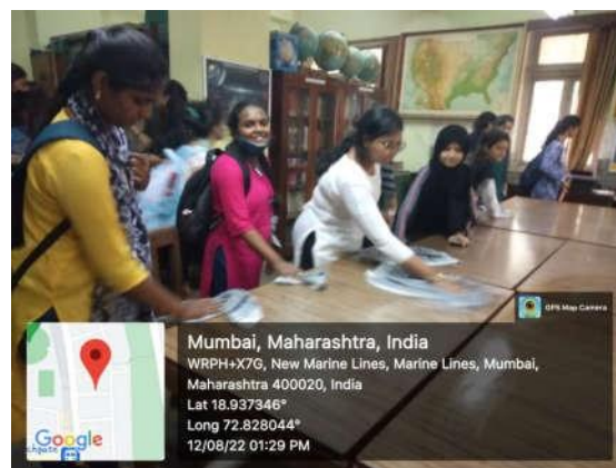
College Campus Cleanliness Drive " Under Azadi ka Amrit Mahotsav " On 12/08/2022