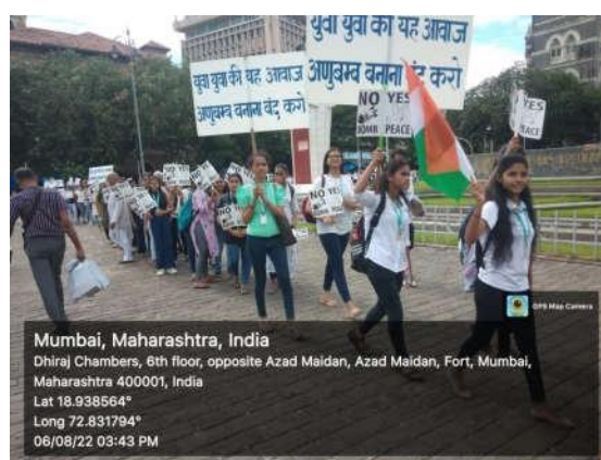
"Silent Peace Rally " to commemorate Hiroshima Day on 6th August 2022